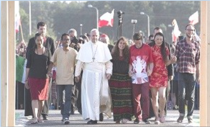
Pope Francis, 37th National Convocation of the renewal in the Holy Spirit, 2014